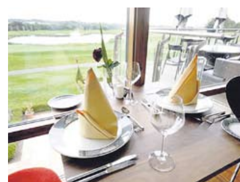
THE WOW FACTOR - A VIEW FROM THE RESTAURANT

The restaurant offers a number of dining choices during the course of the week. According to Michael "from Monday to Thursday we offer an A la carte Lunch and Dinner menu. On Friday and Saturday nights we have both A la carte as well as a Table d'Hôte menu which is remarkably good value at only €55 for two people, including a bottle of wine. Our dinner menu on Sundays is becoming increasingly popular, offering four courses for only €22.50."