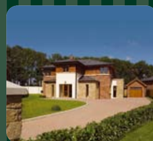
SOMERTON LUXURY HOMES