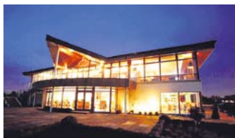
A STUNNING PHOTO OF THE RESTAURANT AT NIGHT

Situated overlooking the Liffey Valley, Castleknock Golf Club boasts some of the most spectacular views in Dublin 15. This fact was paramount in the mind of the architects when designing a clubhouse that would take full advantage of these magnificent views.