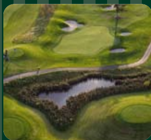
CHAMPIONSHIP GOLF COURSE