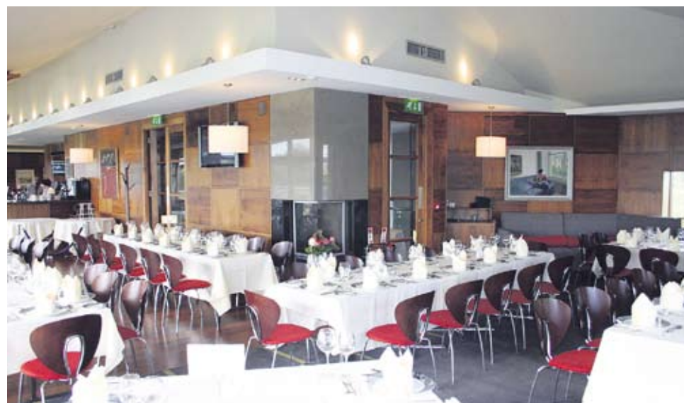
PREPARING FOR A FUNCTION

The restaurant is open every day with lunch available from just €9.95. There is an a la carte menu on offer from Monday to Thursday with an increasingly popular table d'hôte menu on